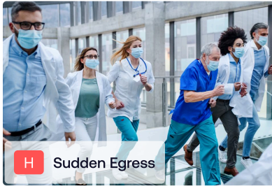
H Sudden Egress