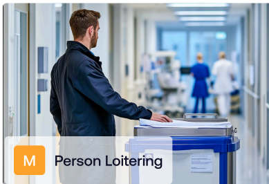
M Person Loitering

Secure sensitive areas like pharmacies, patient wards, and data centers. Ambient AI connects with your existing physical access control systems (PACS) to automatically verify alarms like 'door forced open' or 'door held open' using video context. This cuts down false alarms by over 90-95%, stopping alert fatigue and letting staff focus on real threats. It also detects when secure doors are propped open with objects, and if anyone subsequently enters through the propped-open door. Additionally, it identifies tailgating and perimeter breaches like fence jumping to prevent unauthorized entry at all times.